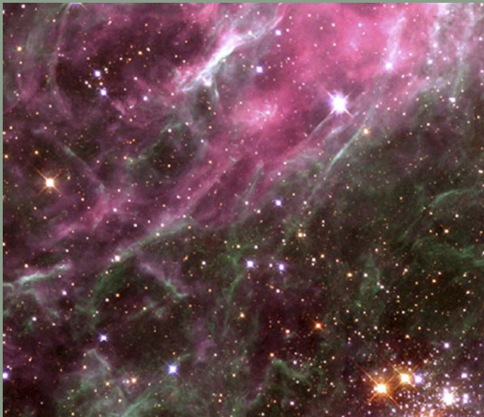
STARS IN THE TARANTULA NEBULA