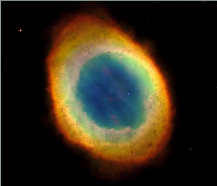
THE RING NEBULA (M57) KNOWN AS "THE EYE OF GOD"