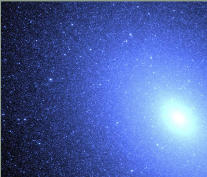
ULTRAVIOLET LIGHT SOURCE FROM AN ANCIENT GALAXY